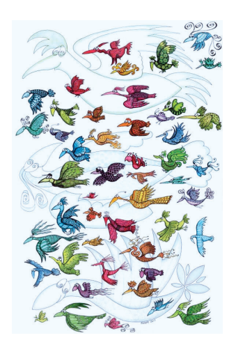
Rose Kapp, The Flock Thickens