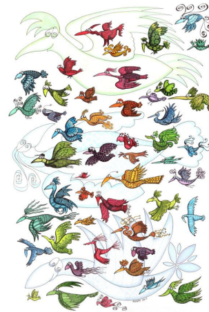
Rose Kapp, The Flock Thickens