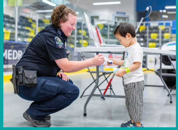
RCMP Contract Updates