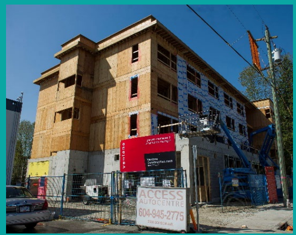
Legislative Changes and Downloading