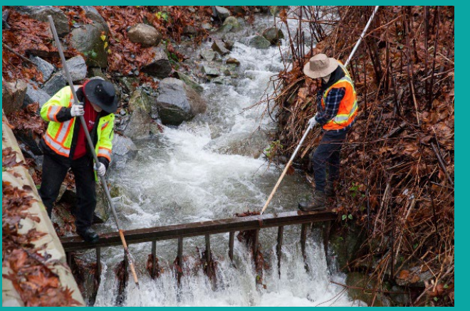
Extreme Weather Preparedness