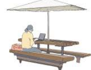
PICNIC TABLE WITH UMBRELLA