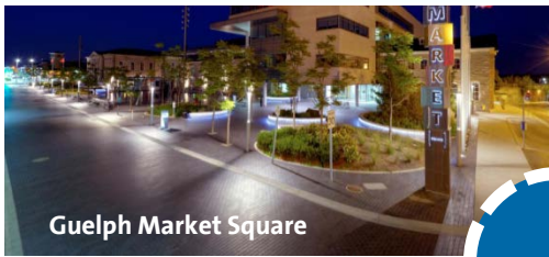
Guelph Market Square