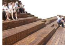
TIMBER SEAT STEPS