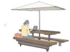
PICNIC TABLE WITH UMBRELLA