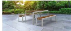
HARVEST TABLE IN LOWER PLAZA