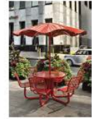
TABLE AND CHAIR IN UPPER PLAZA