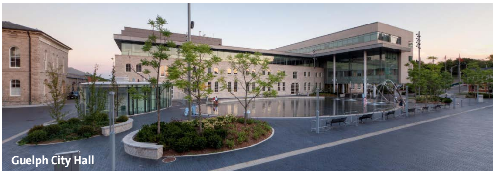
Guelph City Hall