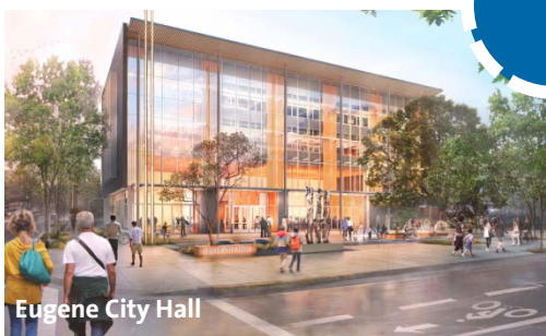
Eugene City Hall