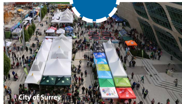
City of Surrey