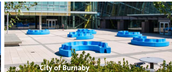
City of Burnaby