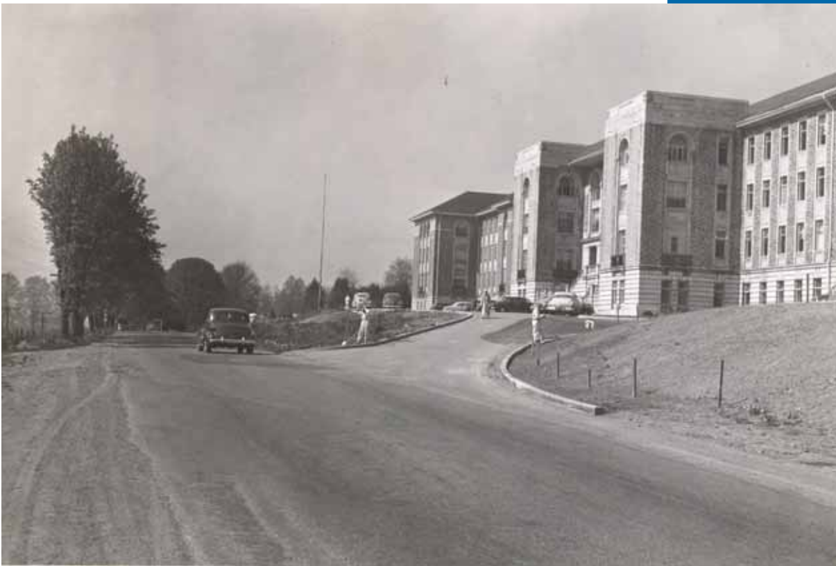
Old Highway, June 1949

1940 The Mental Hospital Act is amended and references to “lunatic” and “insane” are deleted.