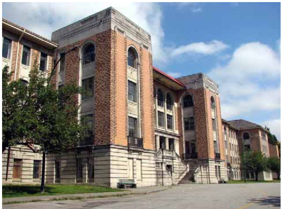
Crease Clinic, current condition

Riverview is an important ecological matrix, positioned between the Coquitlam River, Colony Farm and Riverview Forest, and harbours natural wildlife trails, salmon runs, and remnant meadows. With the site's sloping natural topography and unparalleled views to and from the site, Riverview is an ecological oasis preserved in a rapidly growing urban region.