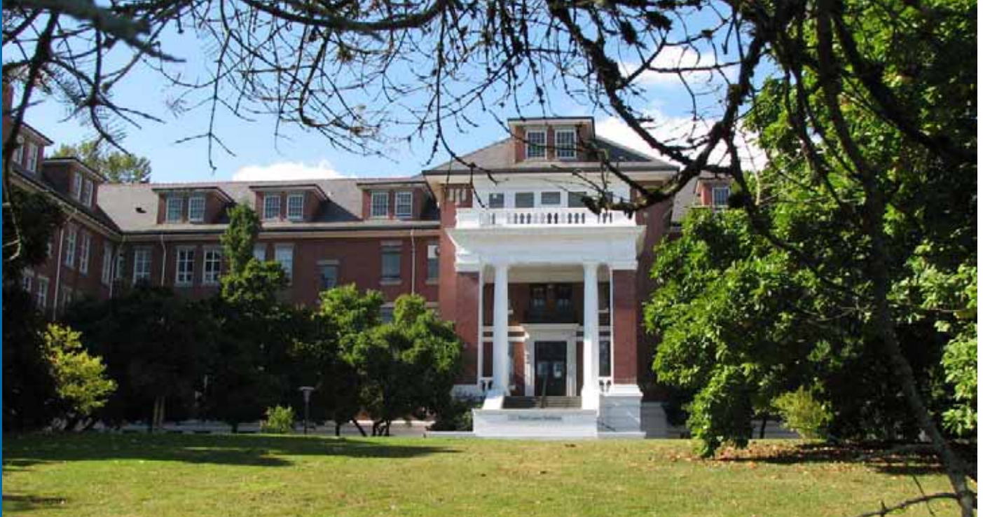
East Lawn Building, current condition

The Royal Engineers lay out Pitt River Road, the second road in British Columbia, through the forest to the northeast of the Coquitlam River, in order to link up to farms and settlements along the Fraser River. A private firm is contracted to construct the road.