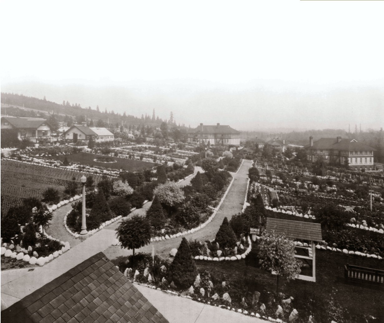
Boys' Industrial School