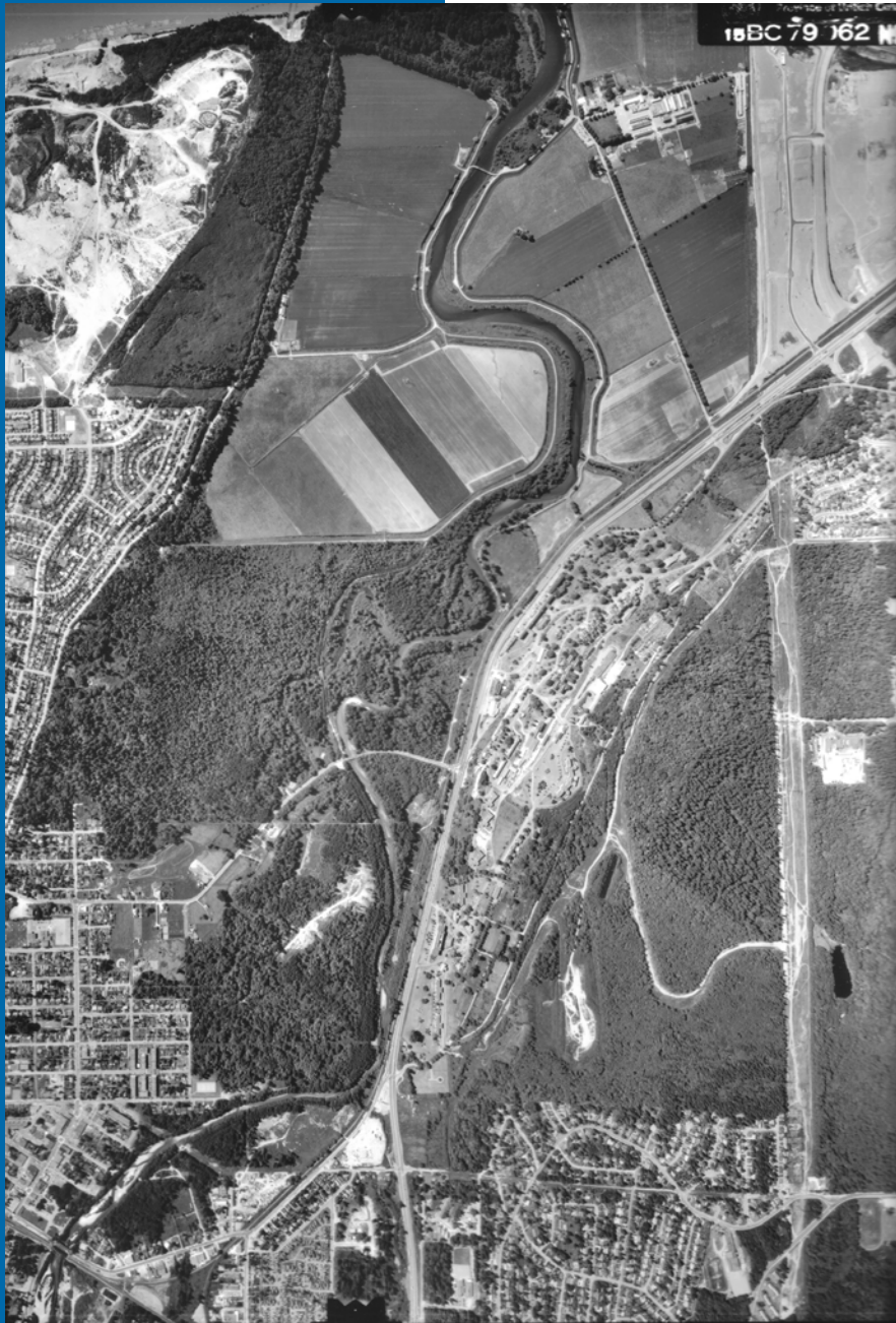
Colony & Riverview Aerial, June 26, 1979

1956 Peak year for Essondale. The site accommodates 4,306 patients and 2,200 staff. Over the next several years community services and new treatments cause the numbers to steadily decline.