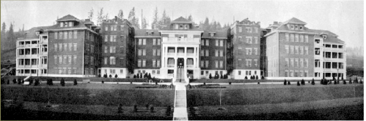
Male Chronic Building - Essondale