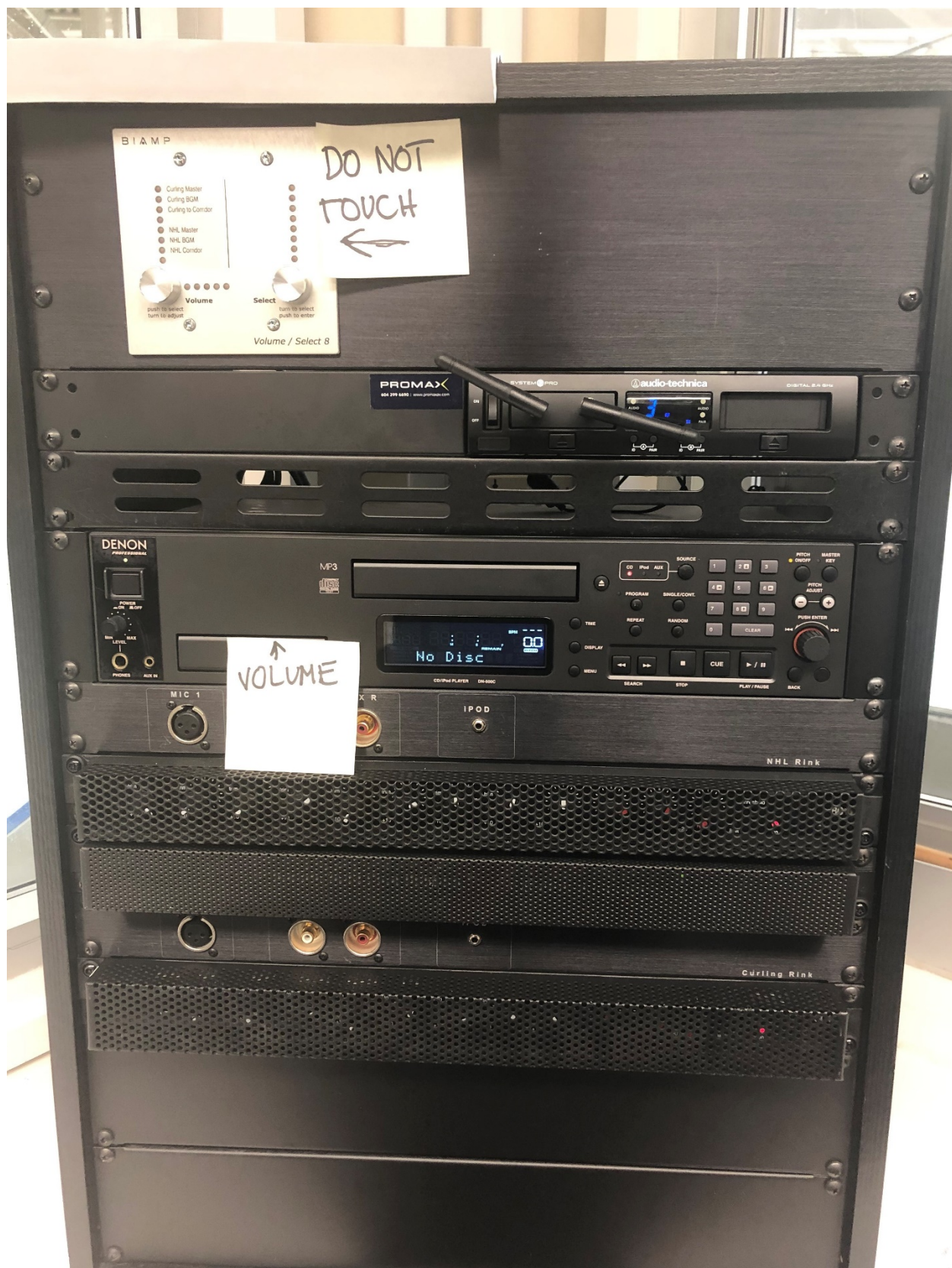
Arena 2 – Sound System