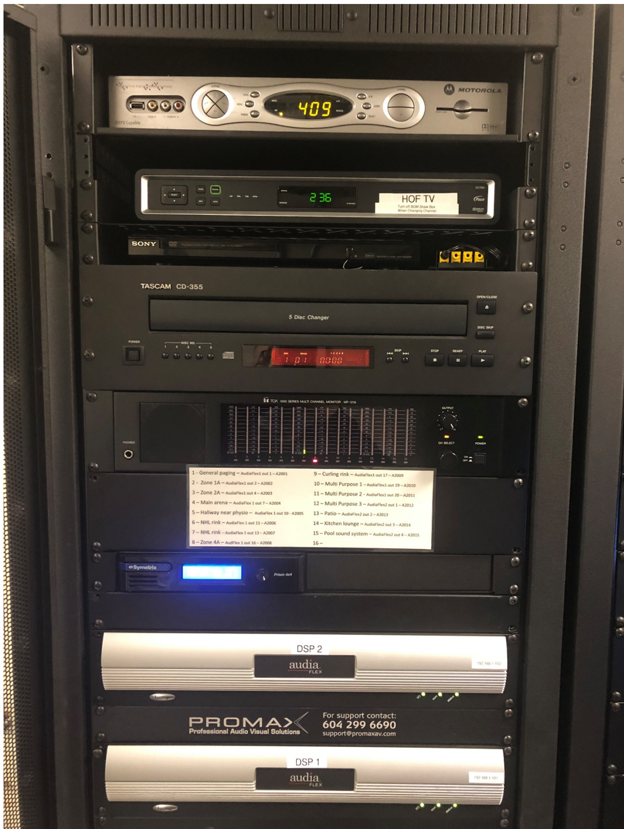
Building Sound System