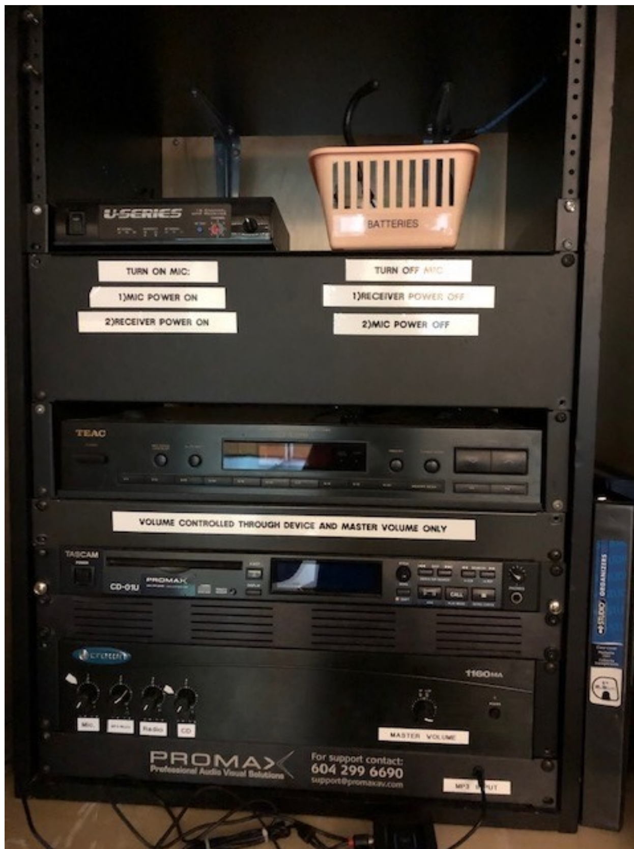
Fitness Studio – Audio Rack