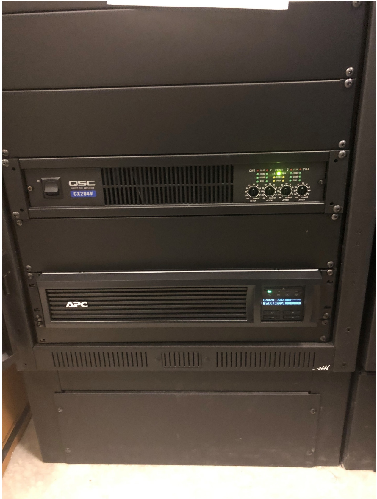
Building Sound System