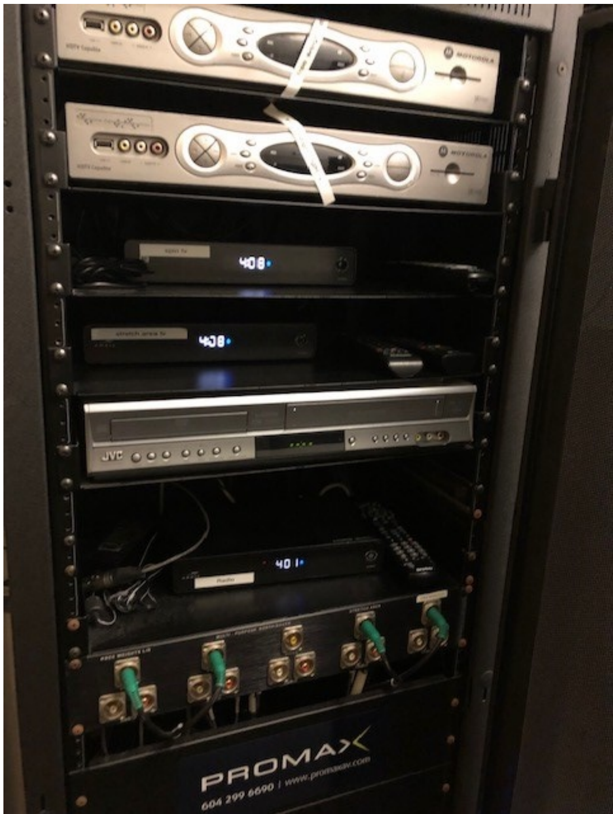
Fitness Centre – Top Rack