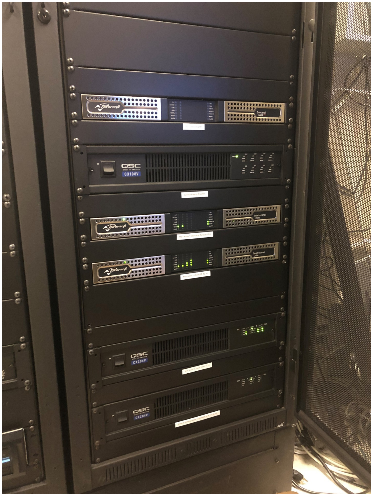
Building Sound System