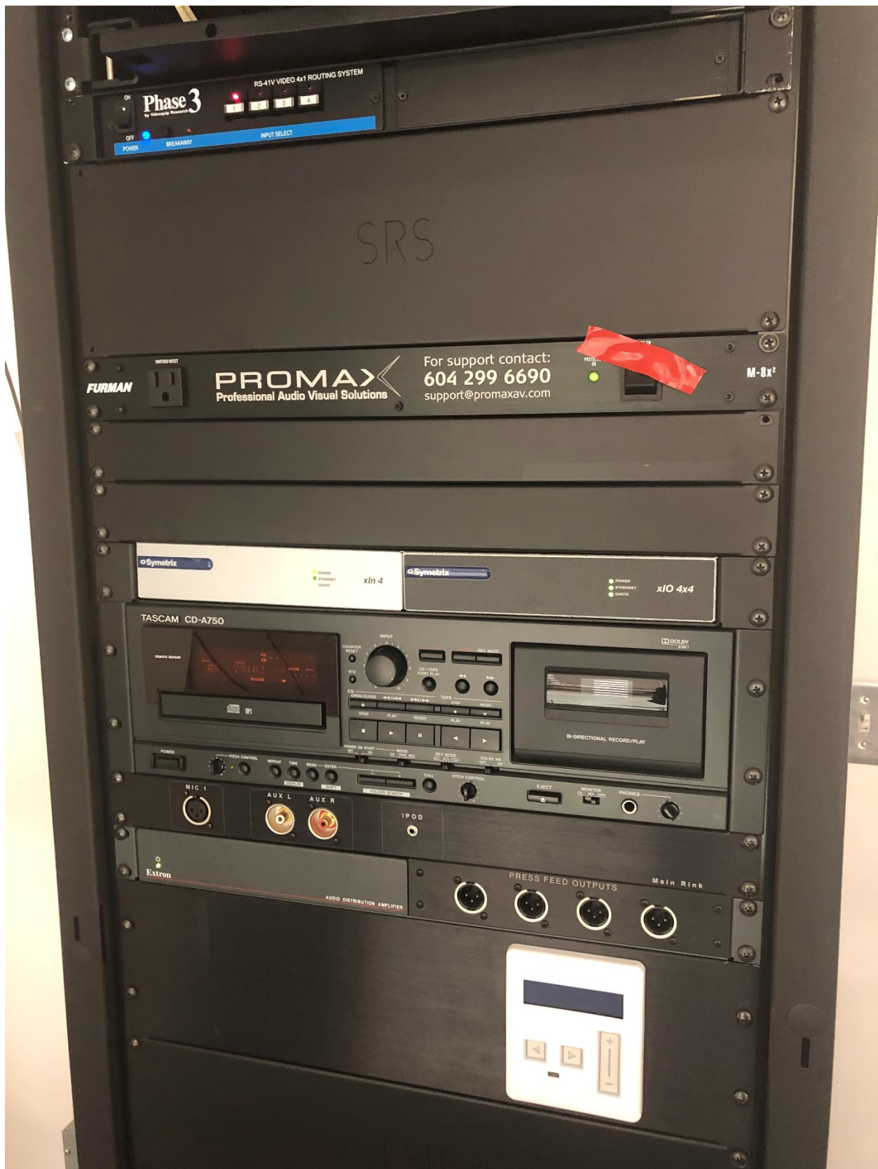
Arena 1 – Sound System