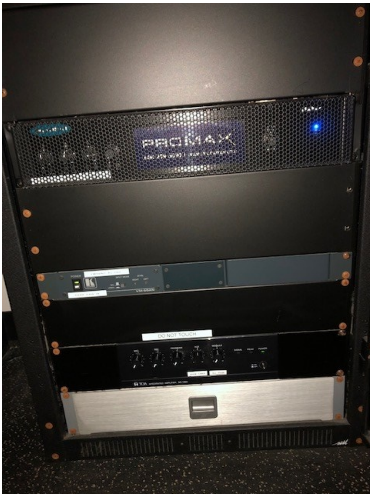
Fitness Centre - Bottom Rack